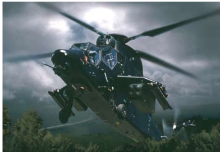
Above: Tiger.